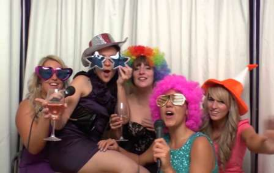
Photo album will be given after the event featuring all the snaps and video taken and a mash up of music video completed with customization.

With cool props, live music, beautiful backdrops, instant playback on a big screen TVs, and the ability to email your individual video to yourself in minutes!