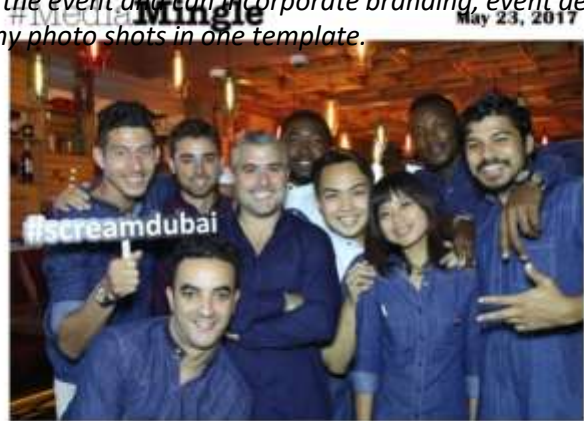
Photo template is the output design for the printed photos. This can be customized depending on the theme of the event and can incorporate branding, event details, and more. Clients can choose how many photo shots in one template.